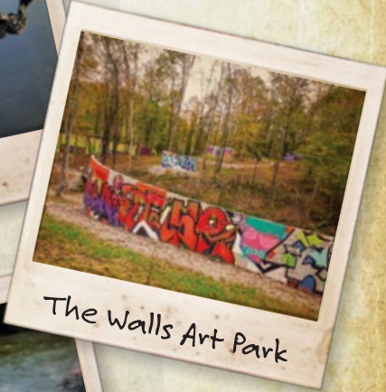
The Walls Art Park