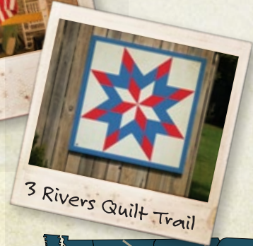
3 Rivers Quilt Trail