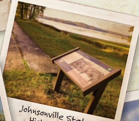
Johnsonville State Historic Park