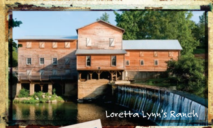
Loretta Lynn's Ranch