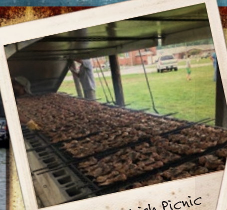
St. Patrick Irish Picnic