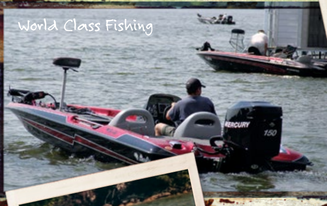
World Class Fishing