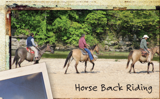
Horse Back Riding