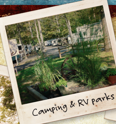
Camping & RV parks