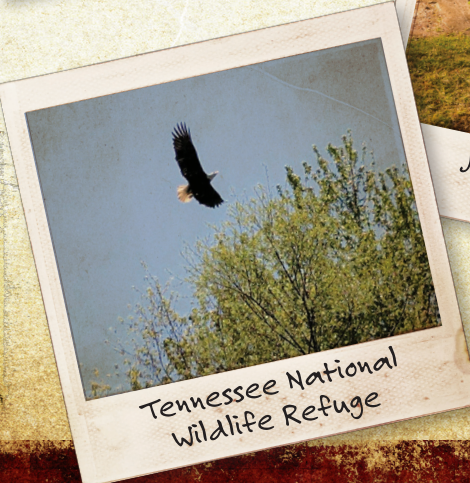
Tennessee National Wildlife Refuge