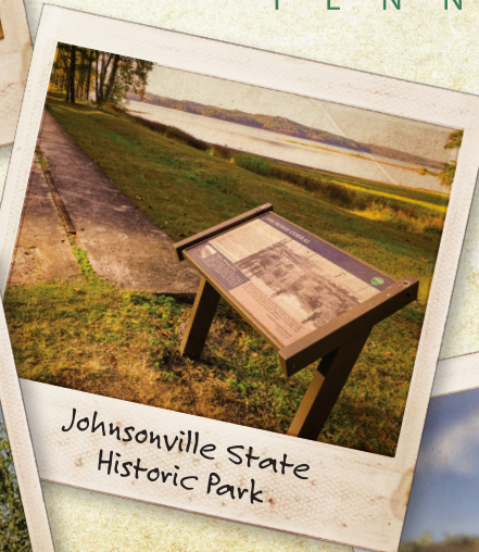
Johnsonville State Historic Park