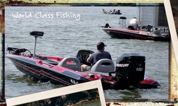
World Class Fishing