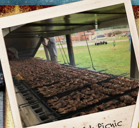
St. Patrick Irish Picnic