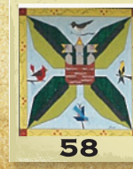
"Birds" North Church St, Waverly Waverly Senior Citizens