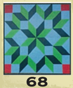
★ "Carpenter's Wheel" 90 Redoubt Lane, New Johnsonville Johnsonville State Historic Park