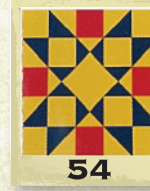
"Providence" 122 West Main, Waverly First Federal Bank