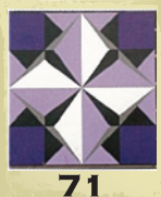
"Director's Choice" 15530 Hwy. 13 South, Waverly/Bufalo Log Cabin Restaurant