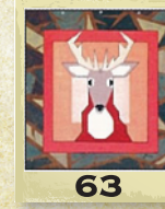
★ "Buck" 2173 Hwy. 13 South, Waverly H. C. Farmers Co-op