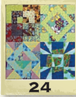
"Sampler Blocks" 100 Sheehy Rd, McEwen Kim Emery