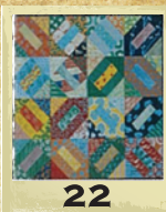
"Vintage Cracker" 100 Sheehy Rd, McEwen Kim Emery