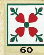
★ "Hearts & Flowers" 201 Fort Hill Rd, Waverly Humphreys County Museum