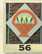
"Flower Basket" 481 Powers Blvd, Waverly Evelyn White