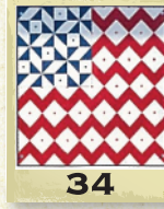
"Flag Variation" 9586 Hwy. 70 East, McEwen Amy L. Mullinicks