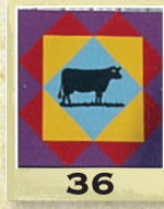
"Gentleman's Fancy" 10290 Hwy. 70 East, McEwen Abernathy's Feed Mill