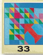
"Tree of Life" 50 Main St, McEwen Proctor Insurance