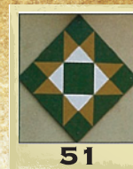
"Nine Patch Star" 332 East Main, Waverly Hoehn Family