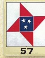
"Friendship Star" 103 East Main, Waverly Waverly City Hall