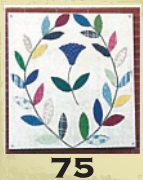
"Love Eternal" 670 Hwy. 13 South, Waverly Humphreys County Nursing Home