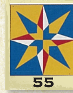
"Tennessee Star" 416 West Main, Waverly First Bank