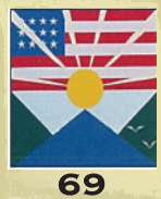
"Sunrise-Sunset" 319 Long Street, New Johnsonville City of New Johnsonville