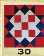
"Uncle Sam's Star" 23 Fortner Rd, McEwen McEwen Senior Citizens