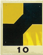
"Bow Tie" 84 Enochs Rd, McEwen Liberty Baptist Church