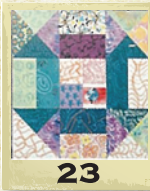
"Hole in the Barn" 100 Sheehy Rd, McEwen Kim Emery