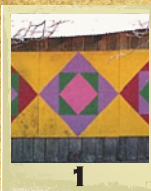
"Square-In-Square" 84 Enochs Rd, McEwen Joyce Enochs Bullington