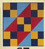
"Jacob's Ladder" 15366 Hwy. 13, Hurricane Mills/Bufalo Loretta Lynn's Kitchen