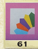
"Dresden Plate" 1018 West Main, Waverly Shear Beauty