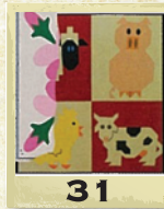
"Farm Animals" 335 Melrose St, McEwen McEwen High School