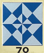
★ "Night & Day" 520 East Main, Waverly Waverly Jr. High School