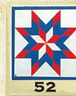
"Stars within a Star" 307 East Main, Waverly Barbara Dillon