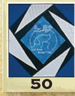
"Crow's Beak" 2695 Hwy. 70 East, Waverly Linda Mount-Baty