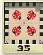
"Ladibugs with Flowers" 9586 Hwy. 70 East, McEwen Amy L. Mullinicks