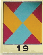
"Twin Sisters" 985 Little Blue Creek Rd, McEwen Lanier & Sue Simpson