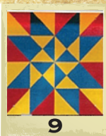
"Solitare" 84 Enochs Rd, McEwen Liberty Baptist Church