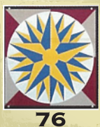
"Triple Star" 528 Broadway Ave, New Johnsonville New Johnsonville Senior Citizens Center