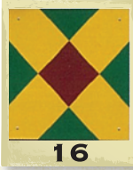
"Album Block" 753 Enochs Rd, McEwen Gail Rosson